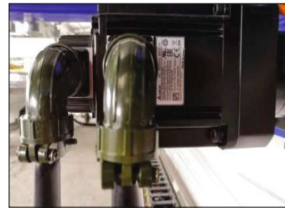
HIWIN Linear guide rail